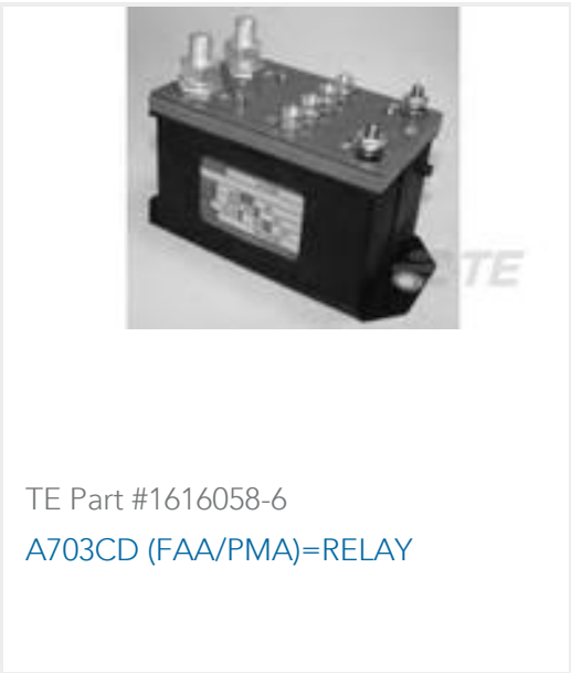
TE Part #1616058-6 A703CD (FAA/PMA)=RELAY