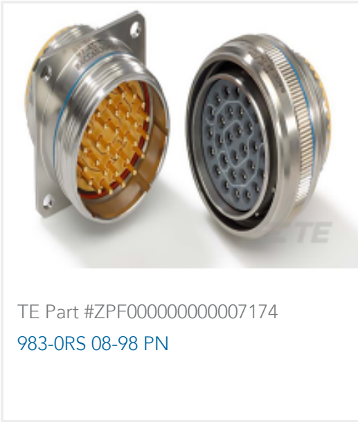
TE Part #ZPF000000000007174 983-0RS 08-98 PN