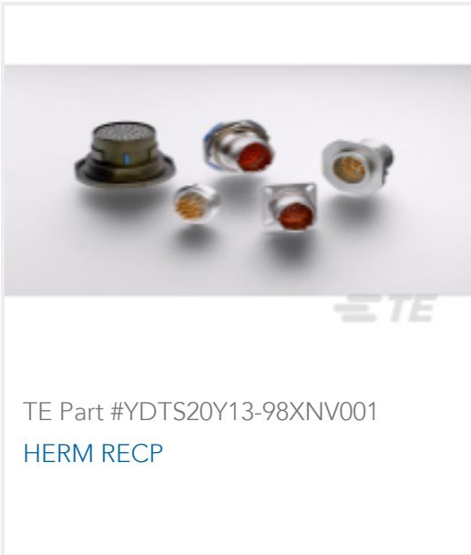
TE Part #YDTS20Y13-98XNV001 HERM RECP