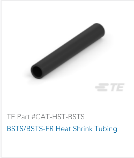
TE Part #CAT-HST-BSTS BSTS/BSTS-FR Heat Shrink Tubing