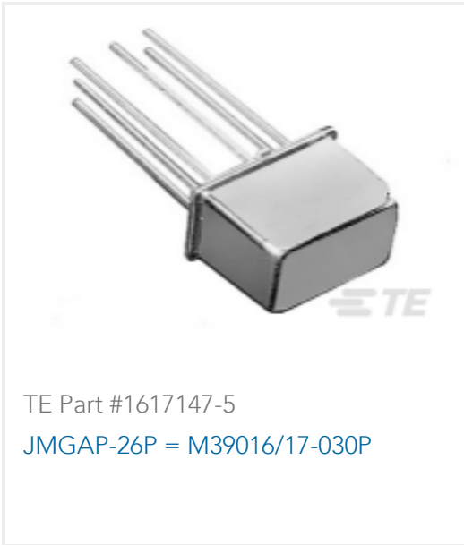
TE Part #1617147-5 JMGAP-26P = M39016/17-030P