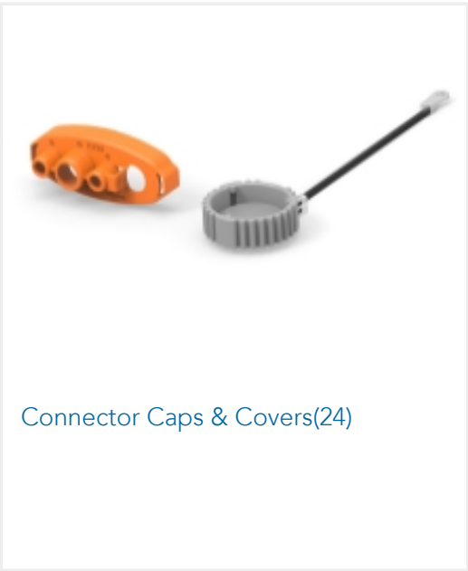
Connector Caps & Covers(24)