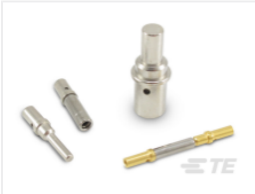
TE Part #CAT-D48-ST273 DEUTSCH Solid Contacts