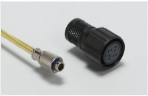
Standard Circular Connectors(1079)