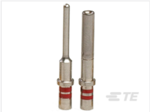
TE Part #ZPF00000000000001261 097-0267-16 A1267