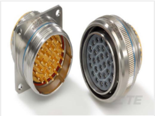
TE Part #ZPF00000000000007174 983-0RS 08-98 PN