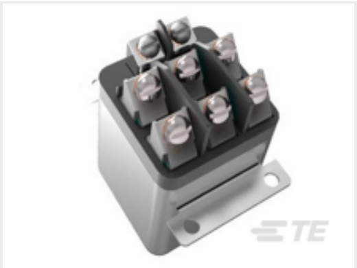
TE Part #1617807-5 FC-335-SY8= RELAY, 3PST