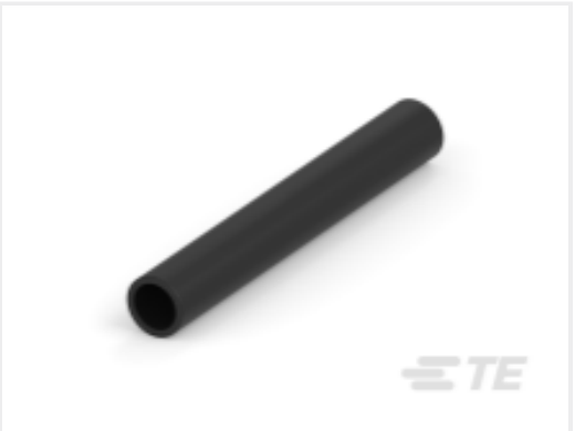
TE Part #CAT-HST-BSTS BSTS/BSTS-FR Heat Shrink Tubing