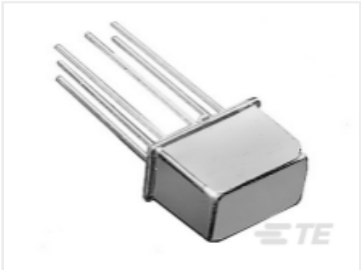
TE Part #1617147-5 JMGAP-26P = M39016/17-030P