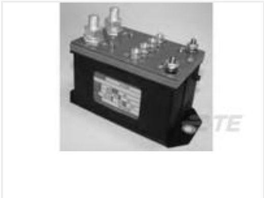
TE Part #1616058-6 A703CD (FAA/PMA)=RELAY