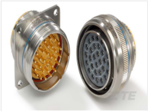
TE Part #ZPF0000000000007174 983-0RS 08-98 PN