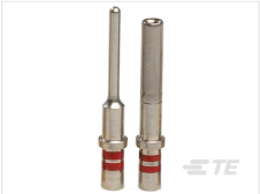
TE Part #ZPF000000000001261 097-0267-16 A1267