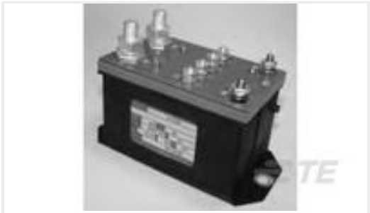
TE Part #1616058-6 A703CD (FAA/PMA)=RELAY