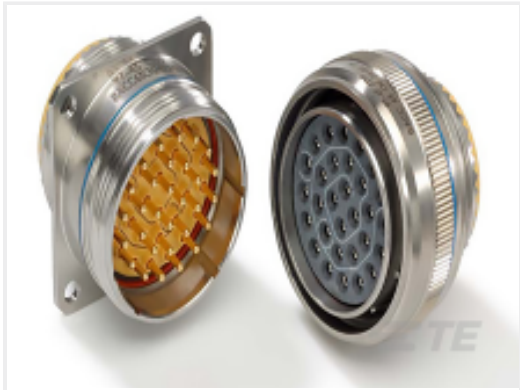
TE Part #ZPF000000000007174 983-ORS 08-98 PN