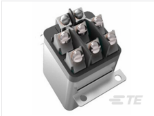
TE Part #1617807-5 FC-335-SY8= RELAY, 3PST