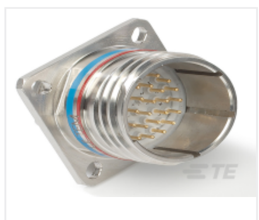
TE Part # YDTS20W25-61AAV001 RECP ASSY