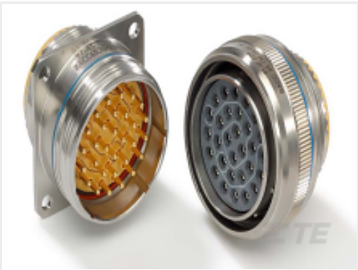
TE Part # ZPF000000000007174 983-ORS 08-98 PN