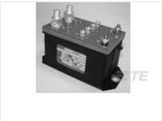
TE Part # 1616058-6 A703CD (FAA/PMA)=RELAY