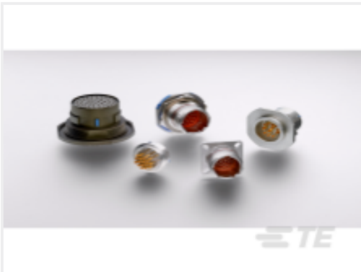
TE Part # YDTS20Y13-98XNV001 HERM RECP

Datasheets & Catalog Pages DEUTSCH MIL-DTL-38999 CIRCULAR CONNECTORS English