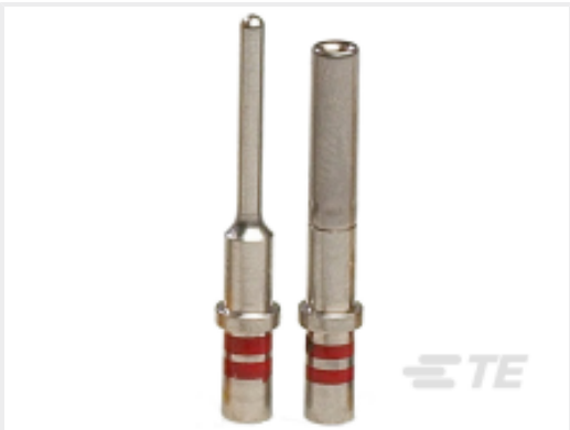
TE Part # ZPF000000000001261 097-0267-16 A1267