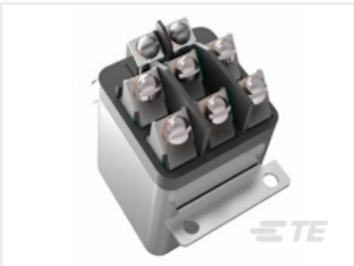
TE Part # 1617807-5 FC-335-SY8= RELAY, 3PST