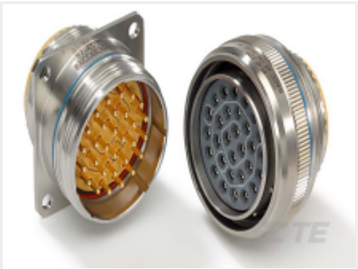
TE Part #ZPF000000000007174 983-0RS 08-98 PN