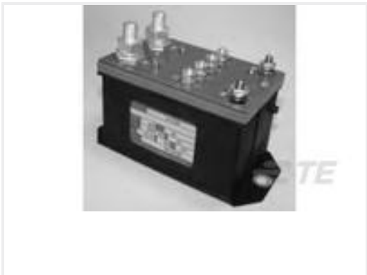
TE Part #1616058-6 A703CD (FAA/PMA)=RELAY