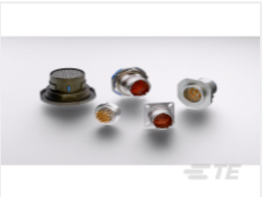
TE Part #YDTS20Y13-98XNV001 HERM RECP

Datasheets & Catalog Pages DEUTSCH MIL-DTL-38999 CIRCULAR CONNECTORS English