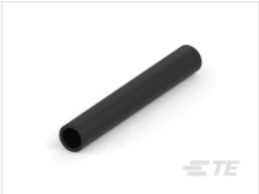
TE Part #CAT-HST-BSTS BSTS/BSTS-FR Heat Shrink Tubing