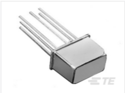
TE Part #1617147-5 JMGAP-26P = M39016/17-030P