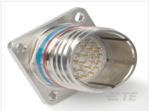
TE Part # CAT-D38999-DTS7N D38999: Square Flange, 25-37 insert