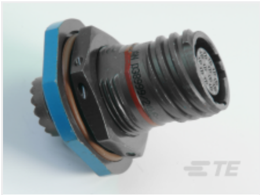
TE Part # CAT-D38999-DTS16H Jam Nut: D38999, 25-37 Insert