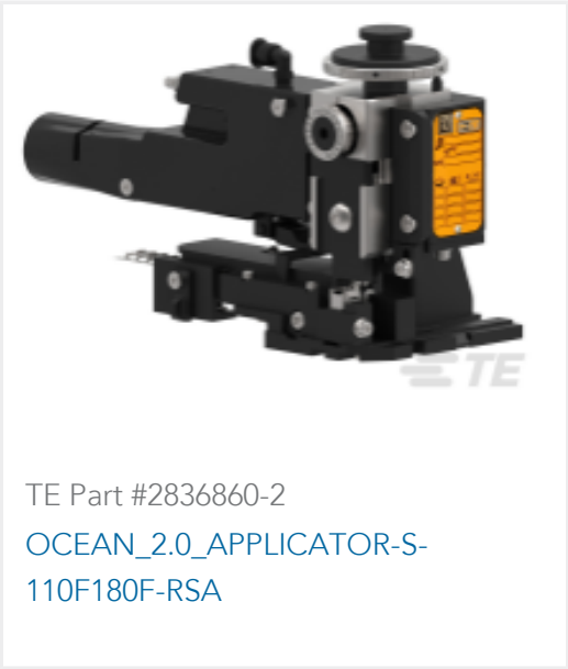
TE Part #2836860-2 OCEAN_2.0_APPLICATOR-S-110F180F-RSA