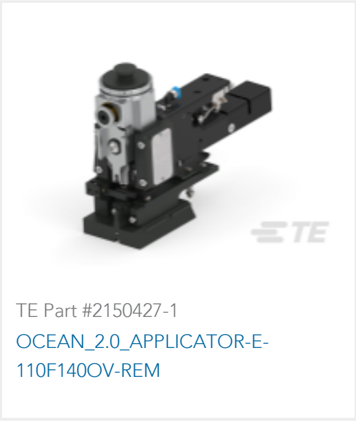
TE Part #2150427-1 OCEAN_2.0_APPLICATOR-E-110F140OV-REM