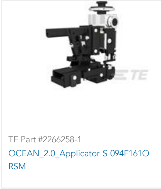
TE Part #2266258-1 OCEAN_2.0_Applicator-S-094F161O-RSM