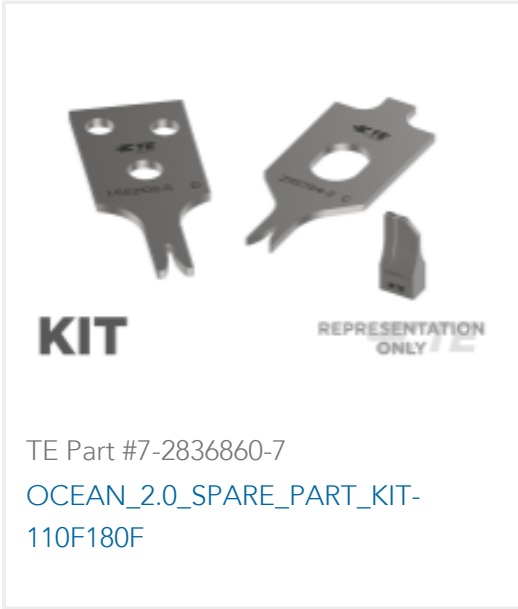
TE Part #7-2836860-7 OCEAN_2.0_SPARE_PART_KIT-110F180F

Datasheets & Catalog Pages Raychem Wire and Cable Quick Reference Guide English