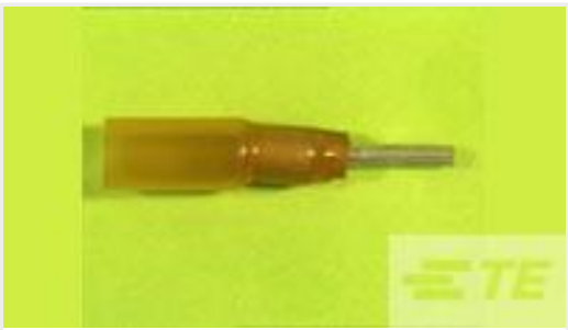
TE Part #555201-000 B-106-6201