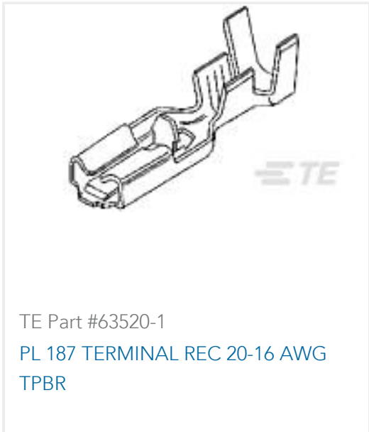
TE Part #63520-1 PL 187 TERMINAL REC 20-16 AWG TPBR