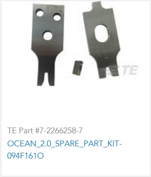
TE Part #7-2266258-7 OCEAN_2.0_SPARE_PART_KIT-094F161O