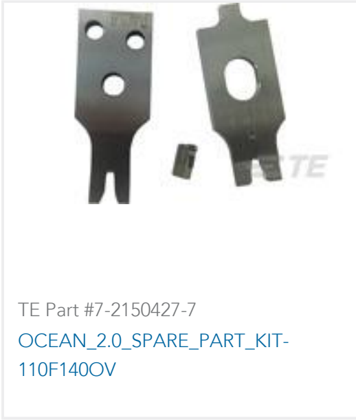
TE Part #7-2150427-7 OCEAN_2.0_SPARE_PART_KIT-110F140OV