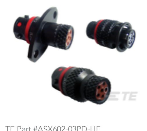
TE Part #ASX602-03PD-HE PLUG ASSY AS SIZE 2 3 WAY