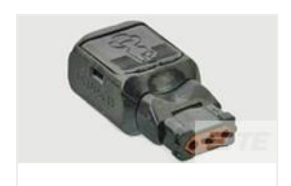
TE Part #D369-P33-NP1 369 3 WAY PLUG, CRIMP, PIN