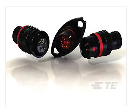
TE Part #ASX602-03PB-HE PLUG ASSY AS SIZE 2 3 WAY