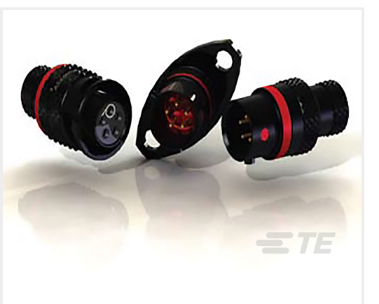
TE Part #ASX102-03SC-HE INLINE REC. ASSEMBLY AS SIZE 2 3 WAY