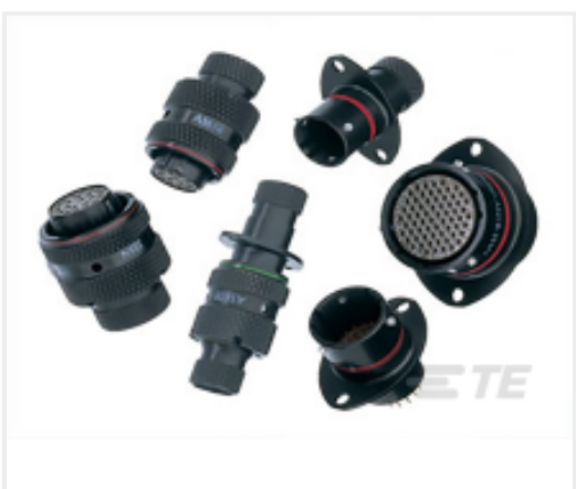
TE Part #AS607-35PA PLUG. BOOT TERMIN. TYPE 6 AS MICRO 7