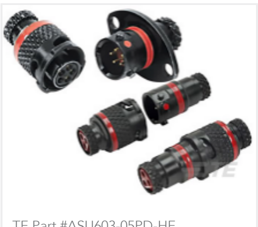
TE Part #ASU603-05PD-HE PLUG ASSY ASU 5 WAY