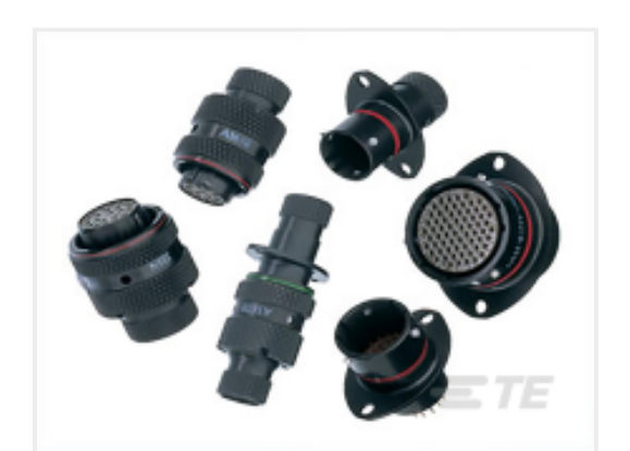
TE Part #ASL106-05PN-HE952K RECEPT.ASSY.IN-LINE. AS MICRO MK3.952K.