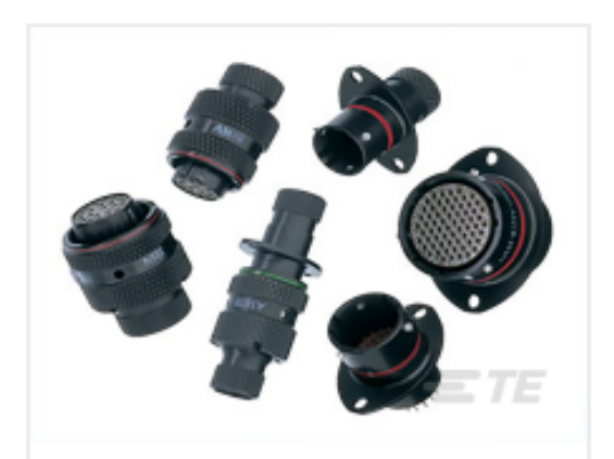
TE Part #AS007-35SB RECEPT. 2 HOLE MNT. TYPE 0 AS MICRO 7