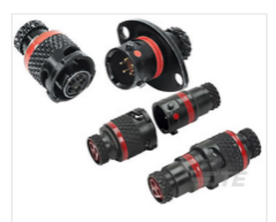
TE Part #ASU103-05SD-HE INLINE RECEPT ASSY ASU 5 WAY