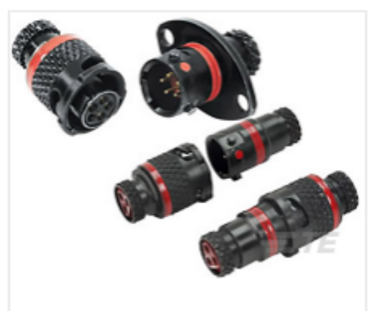
TE Part #ASU103-05PN-HE INLINE RECEPT ASSY ASU 5 WAY