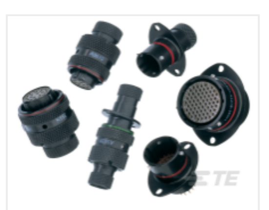
TE Part #AS610-35SN PLUG BOOT TERMINN TYPE 6