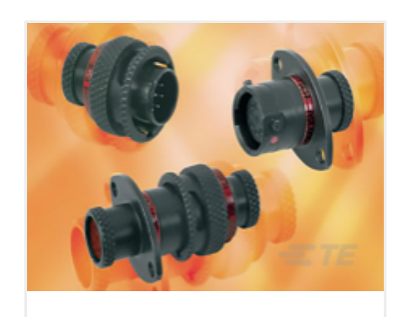
TE Part #ASDD606-09PC-HE PLUG ASSEMBLY ASL 9-WAY

TE Part #605687-ZZ PRO CAP ASSY AS 3 WAY FOR PLUGS