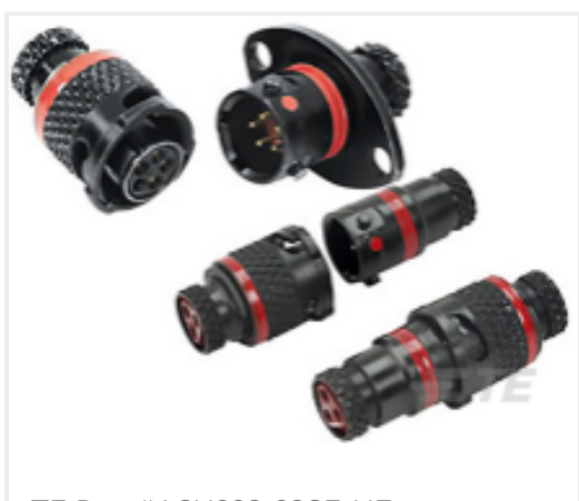
TE Part #ASU003-03SE-HE RECEPT ASSY 2 HOLE MTG AS 3 WAY