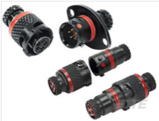
TE Part #ASU003-05SC-HE RECEPT ASSY 2 HOLE MTG ASU 5 WAY