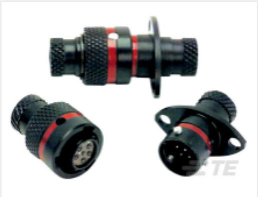
TE Part #AS107-98PN RECEPT. IN LINE TYPE 1 AS MICRO 7