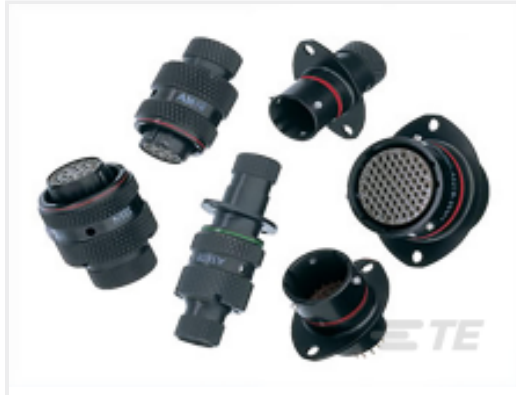
TE Part #ASL606-05SC-HE PLUG ASSY. AS MICRO MK3.