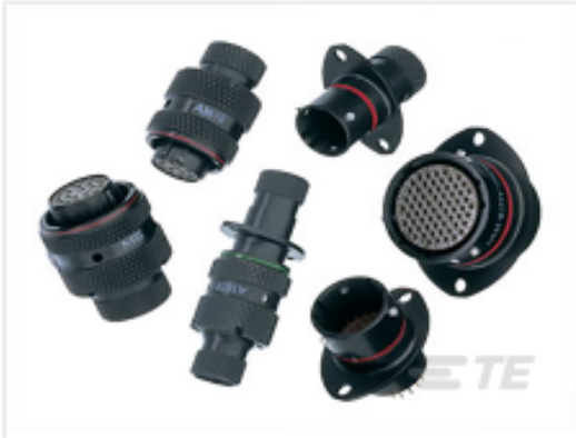
TE Part #AS012-35SA RECEPT.2 HOLE MNT.TYPE 0