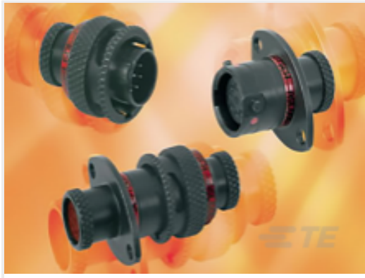
TE Part #ASDD206-09PA-HE RECEPT ASSY 2 HOLE MTG