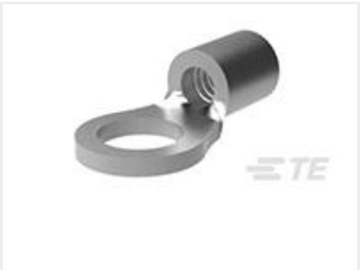
TE Part #31428 TERMINAL,BUDG R 26-22 4