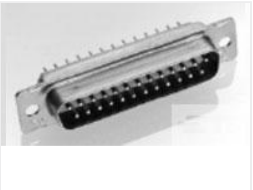
TE Part #1-1757820-0 AMPLIMITE,ASY,RCPT,STD,109,ZN,5,CT