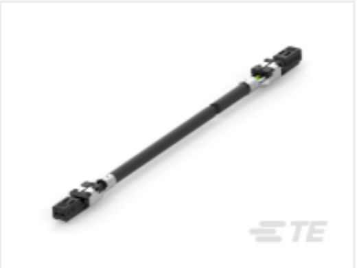
TE Part #2362764-4 MATENET,CABLE ASSY,1 GBPS UTP