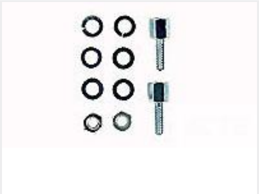
TE Part #5207719-3 KIT SCREWLOCK FEMALE CLEAR ZIN