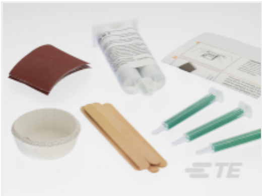
TE Part #657863-000 S1125-KIT-8