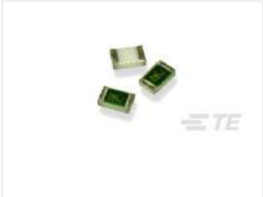
TE Part #4-1879208-9 CPF 0402 1K0 0.1% 25PPM 1K RL