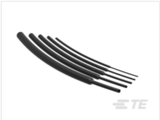
TE Part #CAT-HST-RNF100-0 RNF-100-0 Heat Shrink Tubing