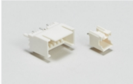
Wire-to-Board Headers & Receptacles (70)