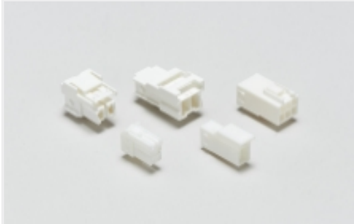
Rectangular Power Connectors(119)