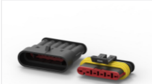
TE Part #CAT-AM71-CH8172 AMP SUPERSEAL 1.5MM, CONNECTOR HOUSING