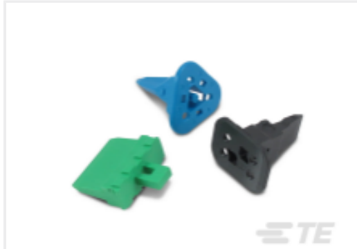
TE Part #CAT-D487-W416 Wedgelocks: DEUTSCH DT