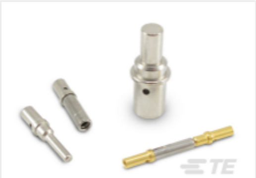
TE Part #CAT-D48-ST273 DEUTSCH Connector Solid Contacts