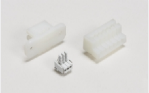
Card Edge Connector Housings(21)