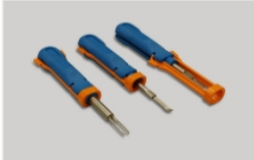
Insertion & Extraction Tools(1)