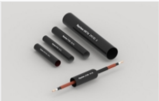
Power Cable Tubing & Accessories(5)