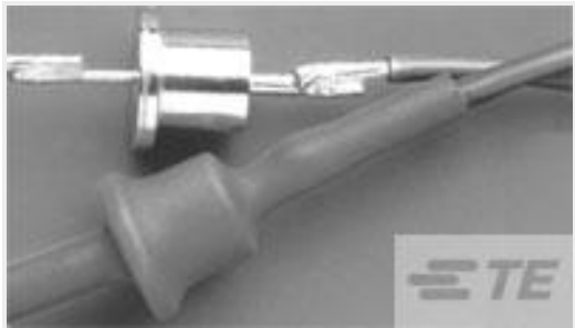
TE Part #5677884006 RNF-3000-24/8-9-SP