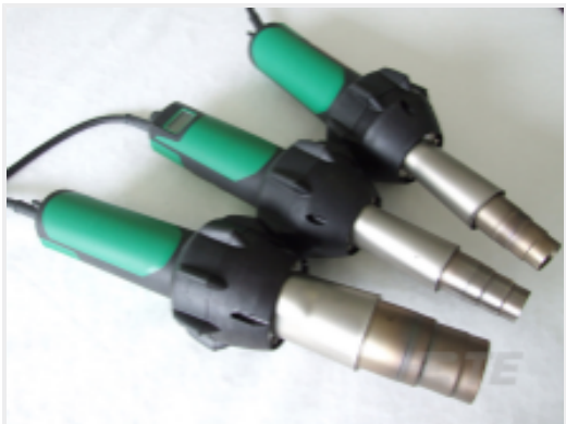
TE Part # EG1114-000 CV1981-ST-230V1600W-EU

limits as defined in the Annexes of Directive 2011/65/EU (RoHS2). Finished electrical and electronic equipment products will be CE marked as required by Directive 2011/65/EU. Components may not be CE marked. Additionally, the part numbers that TE has identified as EU ELV compliant have a maximum concentration of 0.1% by weight in homogenous materials for lead, hexavalent chromium, and mercury, and 0.01% for cadmium, or qualify for an exemption to these limits as defined in the Annexes of Directive 2000/53/EC (ELV). Regarding the REACH Regulation, the information TE provides on SVHC in articles for this part number is based on the latest European Chemicals Agency (ECHA) 'Guidance on requirements for substances in articles' posted at this URL: https://echa.europa.eu/guidance-documents/guidance-on-reach