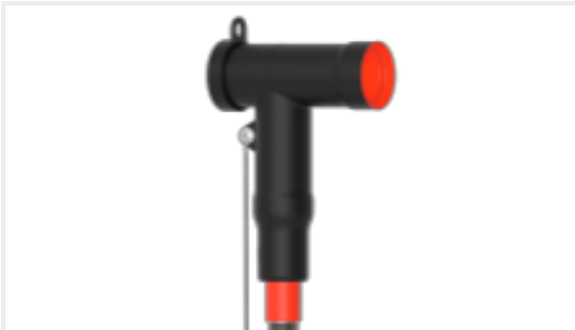
TE Part #CAT-RSTI Screened Separable Connectors 1250 A