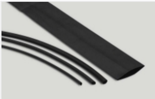
Single Wall Tubing(842)