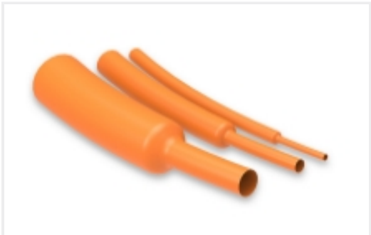
Orange Heat Shrink Tubing(44)