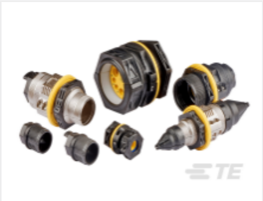
TE Part #ZPF0000000000097664 D-EASY 03 A