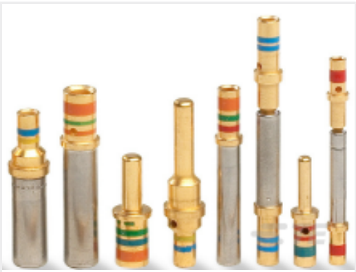
TE Part #ZPF000000000001190 097-0004-16