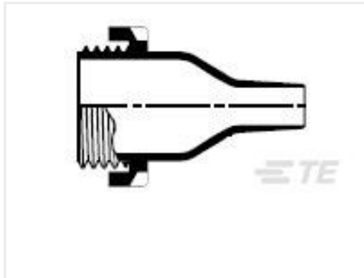
TE Part #401715-000 207W213-25/225-0