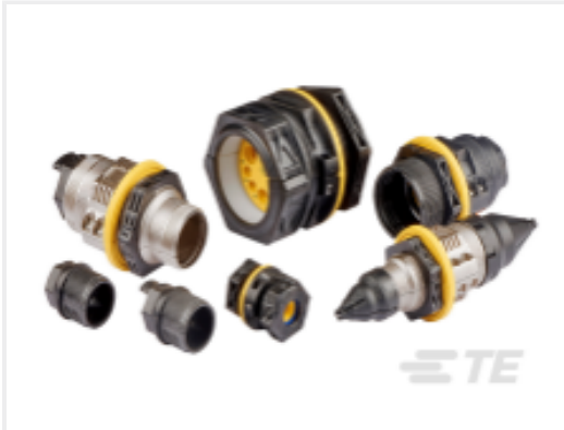
TE Part #ZPF0000000000137412 D-EASY 03 B 05