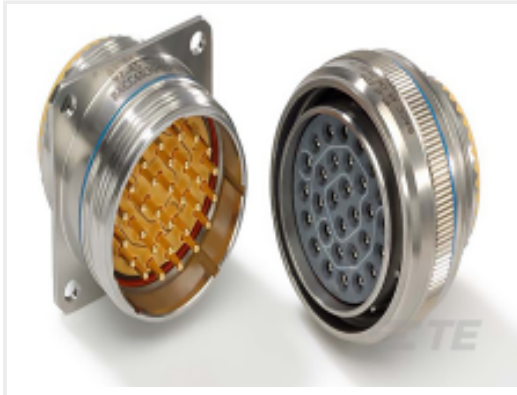
TE Part #ZPF200000000008816 983-6SE 12-12 SN-L