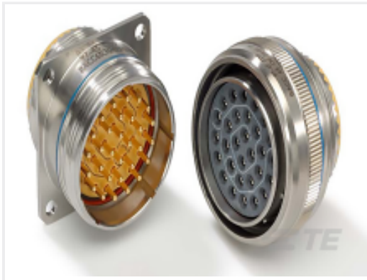
TE Part #ZPF000000000008764 983-6SE 10-06 S7 L