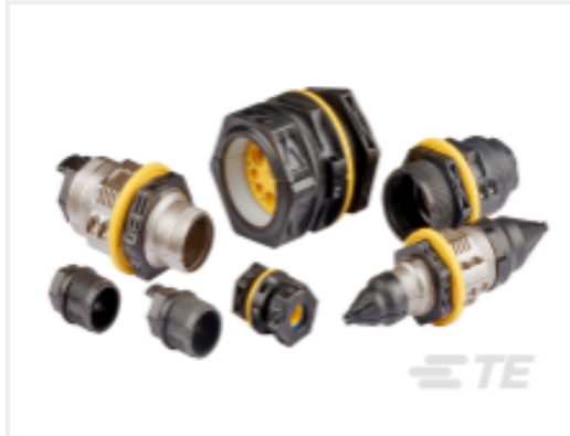
TE Part #ZPF0000000000097665 D-EASY 03 B