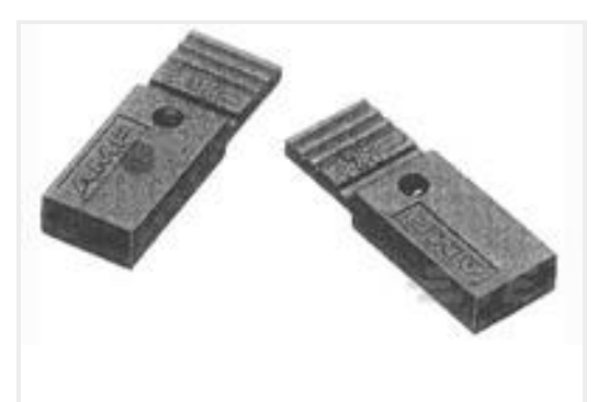
TE Part #881545-2 SHUNT LP W/HANDLE 2 POS 30AU