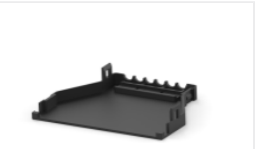
TE Part #1776695-1 Strain Relief, D5200, Dynamic