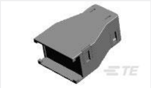
TE Part #1986185-1 Strain Relief,6 Posn,D5200 Dynamic. 2