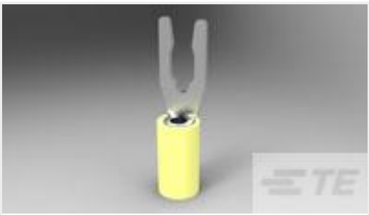
TE Part #52430-3 TERMINAL,PIDG SPR SPD 12-10 6