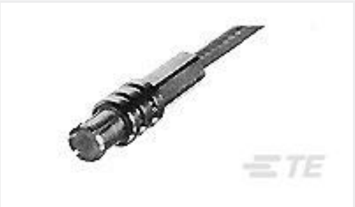
TE Part #1060875-2 MCX CABLE PLUG, CRIMP ATTACH