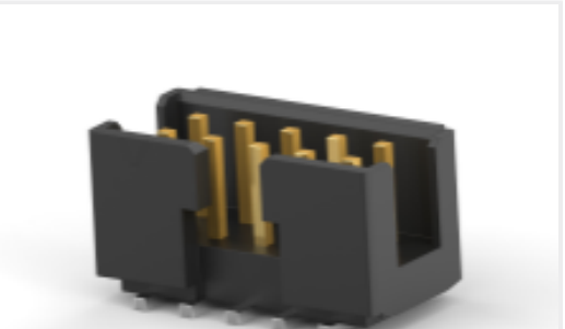
TE Part #1-2373376-0 10P,2MM,SHRD HDR,DRVT,SMD,0.1 AU,TB