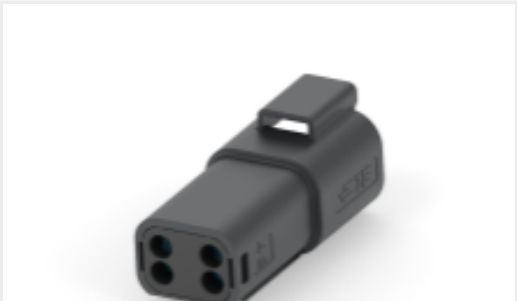
TE Part #1-2600030-0 4CCT BLACK RECEP W/LARGE SEAL