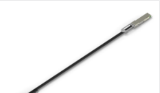
TE Part #2333393-7 QSFP 25GIG 30AWG 3 METER