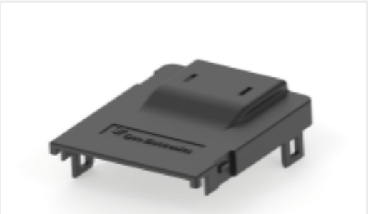
TE Part #1986186-1 Strain Relief,20 Posn,D3000 Dynamic, 2