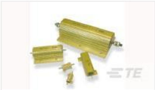
TE Part #1-1630019-4 HSC200 2K4 5%