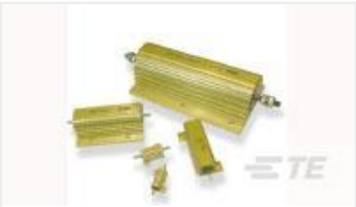
TE Part #1-1630019-4 HSC200 2K4 5%