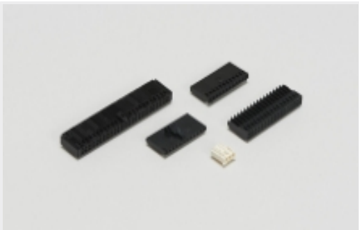
Wire-to-Board Connector Assemblies & Housings(92)