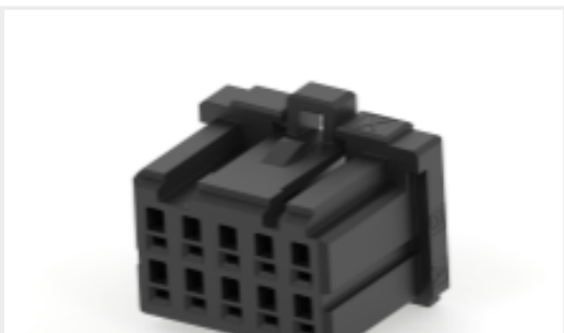
TE Part #CAT-D9934-A15B Receptacle and Tab Housing: 2.5 mm Pitch, 250V