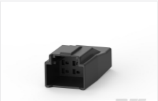
TE Part #2-2366600-6 DYNAMIC D1000 SLIM TAB HSG 6P Y KEY