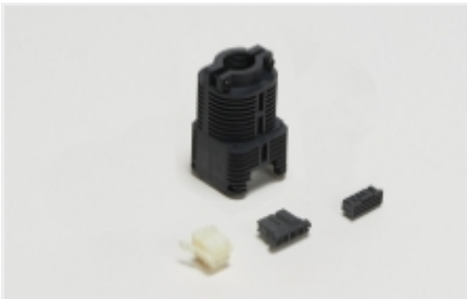
Rectangular Connector Housings(143)