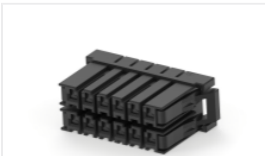
TE Part #CAT-D9934-A75B Receptacle and Tab Housing: 5.08 mm Pitch, 250-600V