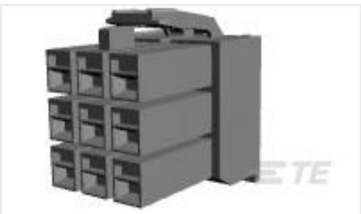
TE Part #176276-1 AMP UNIVERSAL POWER PLUG 9P