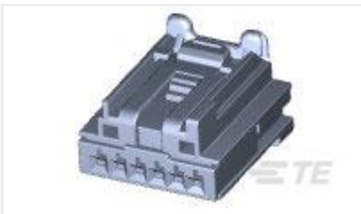
TE Part #2035363-2 1X6 GENERATION Y ASSY KEYB CPA