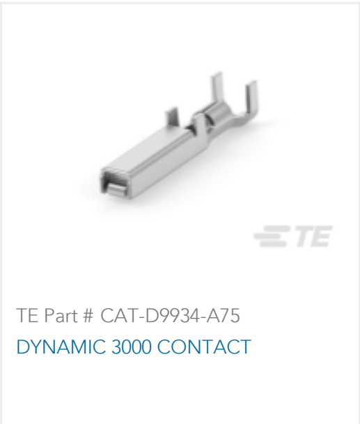
TE Part # CAT-D9934-A75 DYNAMIC 3000 CONTACT