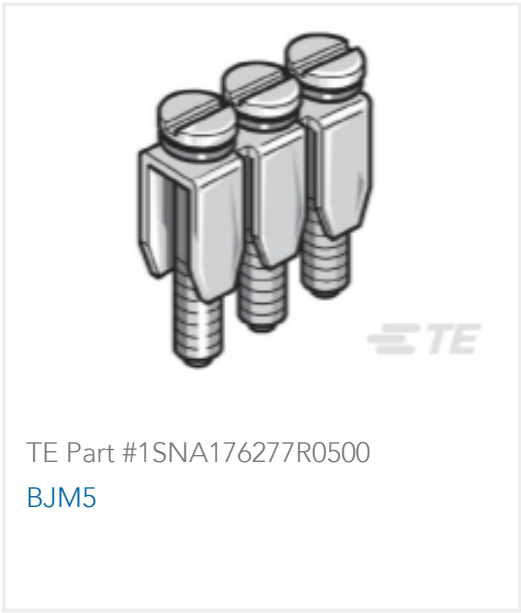
TE Part #1SNA176277R0500 BJM5