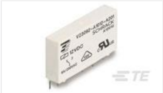
TE Part #1956024-4 V23092-S1024-A301