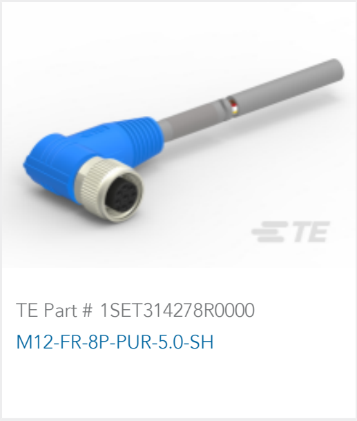
TE Part # 1SET314278R0000 M12-FR-8P-PUR-5.0-SH