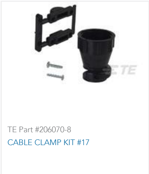
TE Part #206070-8 CABLE CLAMP KIT #17