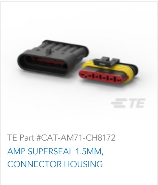
TE Part #CAT-AM71-CH8172 AMP SUPERSEAL 1.5MM, CONNECTOR HOUSING