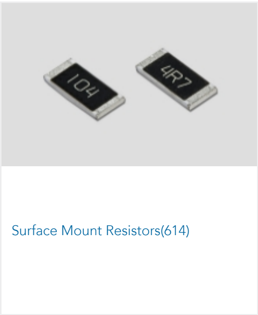
Surface Mount Resistors(614)