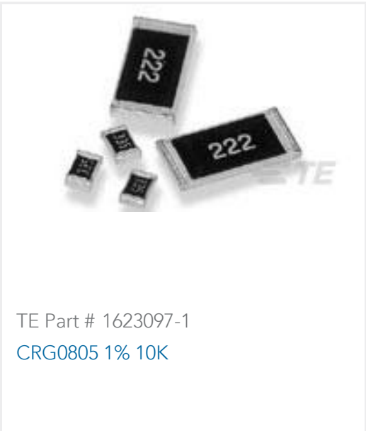
TE Part # 1623097-1 CRG0805 1% 10K