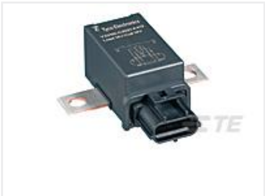
TE Part #1-1414939-4 V23130C2021A412-EV-CBOX