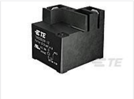
TE Part #6-1419102-0 T9AP1D52-12