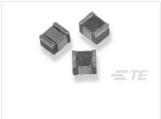
TE Part #8-1624112-0 3650 0603 30nH 5% 2K RL