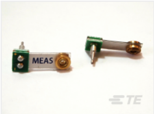
TE Part #1006015-1 LDTCH,REDUCED HEIGHT