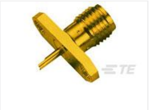
TE Part #1-1478963-0 SMA PNL SKT RCPT, 2/FLNG GSS