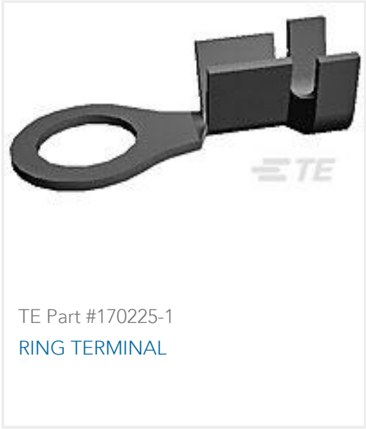
TE Part #170225-1 RING TERMINAL