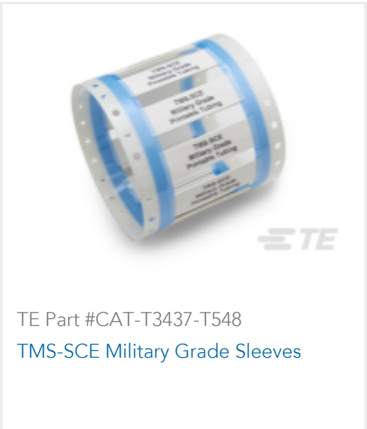
TE Part #CAT-T3437-T548 TMS-SCE Military Grade Sleeves