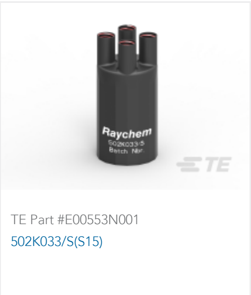
TE Part #E00553N001 502K033/S(S15)