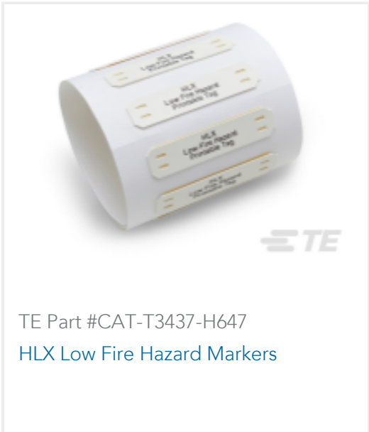
TE Part #CAT-T3437-H647 HLX Low Fire Hazard Markers