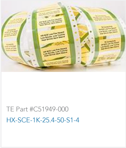
TE Part #C51949-000 HX-SCE-1K-25.4-50-S1-4