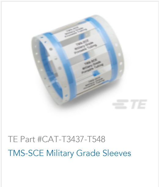
TE Part #CAT-T3437-T548 TMS-SCE Military Grade Sleeves