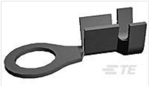
TE Part #170225-1 RING TERMINAL