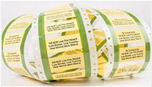
TE Part #C51949-000 HX-SCE-1K-25.4-50-S1-4