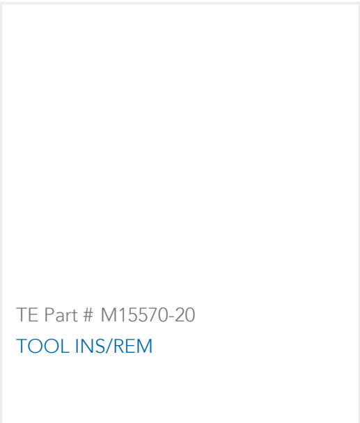
TE Part # M15570-20 TOOL INS/REM