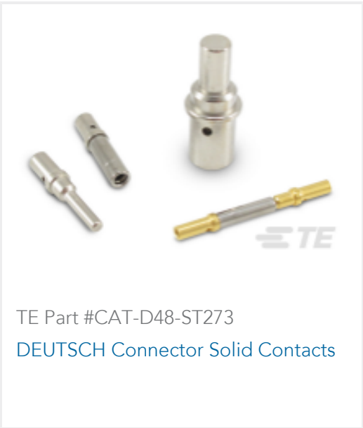
TE Part #CAT-D48-ST273 DEUTSCH Connector Solid Contacts