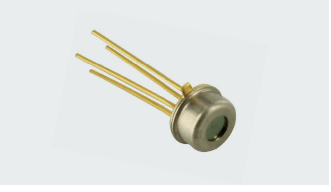
Thermopiles are the critical sensing element for non-contact temperature scanning systems.