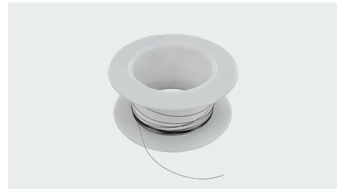
TE's micro-thermcouple assemblies are key component for a range of catheter products.

Thermopiles are used in a variety of temperature scanning devices for airports, offices, schools and anywhere else where screenings are needed. Our enhanced portfolio of analog and digital thermopile elements help address this need.