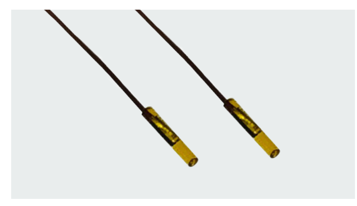
NTC thermistors are utilized in a range of disposable medical temperature assemblies.

TE has recently expanded their line of <u>platinum thin film</u> <u>elements</u>. TE's RTD platinum thin film elements provide high accuracy and stability, with a wide selection of standard sizes, accuracy classes and are available in both Pt100 and Pt1000 base resistance values to meet the growing industry demand for accurate, stable and reliable platinum sensor elements.