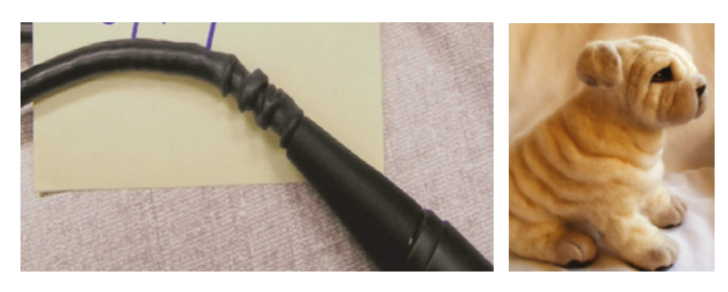
Fig.4. "Shar Pei" effect-stretching of cable jackets due to repeated manual cleaning

In autoclave sterilization, the primary risks to the device materials and design are the pressure extremes and the high-temperature steam.