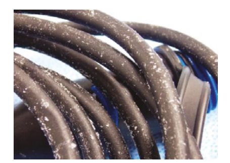
Fig.3. Blooming of Additives after repeated H_2O_2 Sterilization.