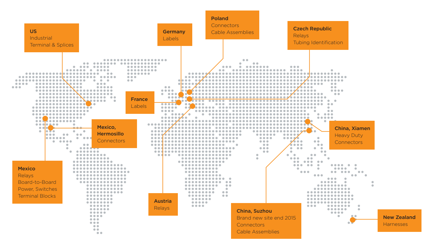
TE Connectivity worldwide — our production sites

Welcome to Automation & Control. TE Connectivity is a major player in plant and mechanical engineering and industrial automation. We have been maintaining partnerships with leading companies in the automation industry in key markets such as Germany, Japan, the United States and China for around six decades.