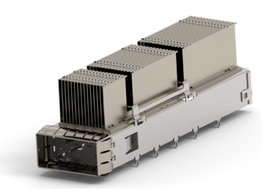
1x1 cage with thermally enhanced zipper fin heatsinks