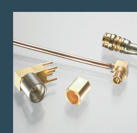
RF Coax Connectors