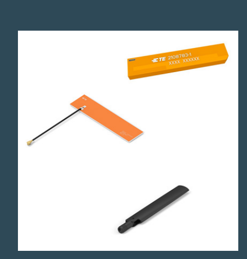
Standard and Custom Antennas