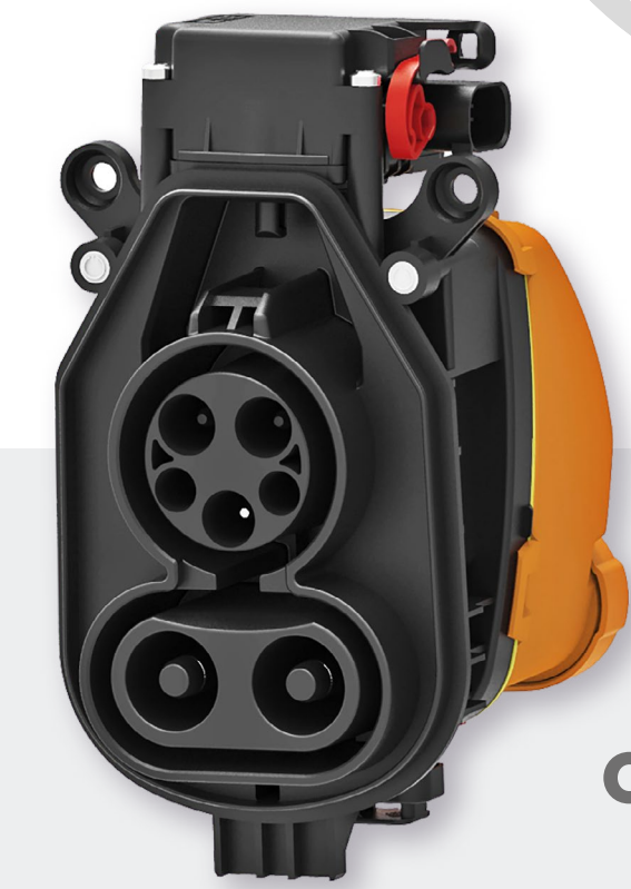
C CHARGING INLETS

“ CONNECTIVITY, FROM POWER TO PROPULSION, IS A KEY ENABLER OF BRINGING THE ELECTRIC MOBILITY VISION TO REALITY. ”