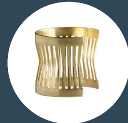
Louvertac bands (791)