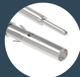
High current Power size 16