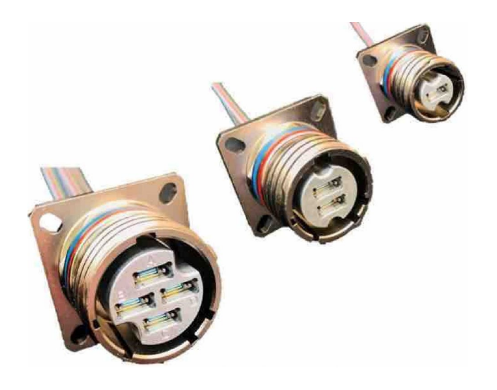
IMAGE: TE Connectivity D38999 Series III Style Circular Connectors with a self-locking, anti-vibration coupling mechanism and up to four MT ferrules capable of accommodating up to 96 optical channels.

In the commercial datacom world, MT fiber optic ferrules provide super-high-density interconnects that accommodate 12 to 96 fibers in a compact and lightweight ferrule. MT ferrules deployed in VPX applications in harsh environments typically have 12 or 24 fibers per ferrule, resulting in up to 48 fiber paths in a half VPX module. There are also MIL¬DTL-38999 Series III based expanded beam connectors available that provide self-locking anti-vibration coupling mechanism for up to 96 optical channels. With these solutions, you can get the best of both worlds — high signal density and harsh-environment performance.