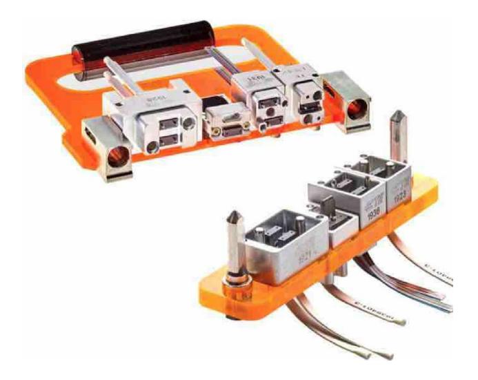
IMAGE: <u>TE</u> <u>Connectivity's ruggedized optical backplane</u> <u>interconnect system</u> meets VITA 66.1 and 66.4 open architecture specifications for VPX systems and provides a high-density, blindmate optical interconnect in a backplane/daughtercard configuration. The fiber optic ribbon cable interconnect feeds through the backplane to removable system modules using MT ferrules.

The same polishing/performance rules apply to MT ferrules, which are molded as flat (typically for multimode fiber) or APC (typically for single mode fiber) configurations. In terminating these various designs, changing the polishing fixtures is the main difference. Lensed MTs (EBs) typically have the lens molded into the ferrule, so no polishing step is required, but you have to cleave the ribbon fiber precisely.