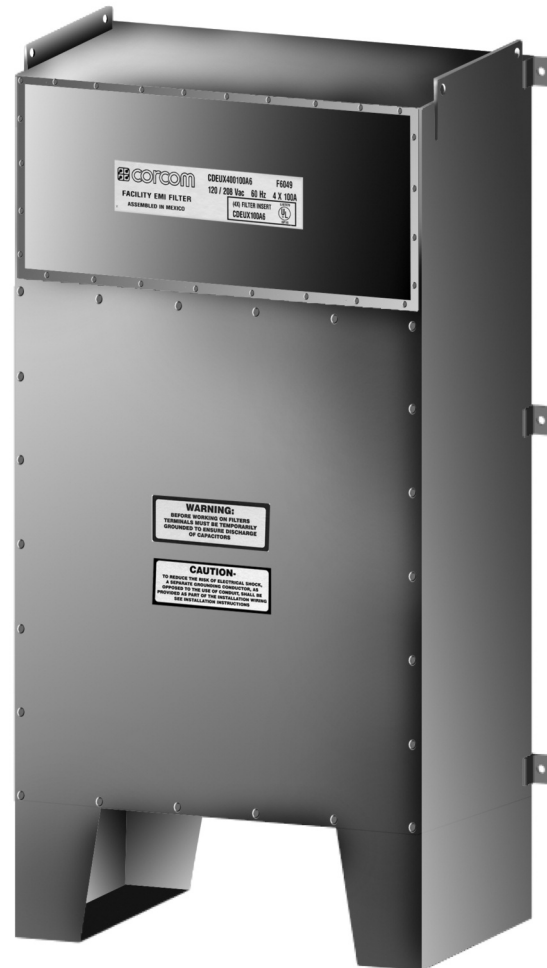
Shown with optional legs Center mounting bracket not installed on all sizes