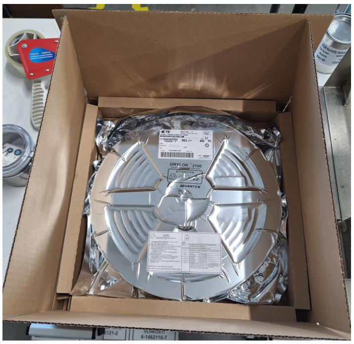
Figure 7: The vacuum bag in the inner box