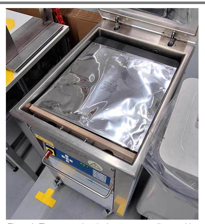
Figure 6: The vacuum bag in the vacuum sealing machine