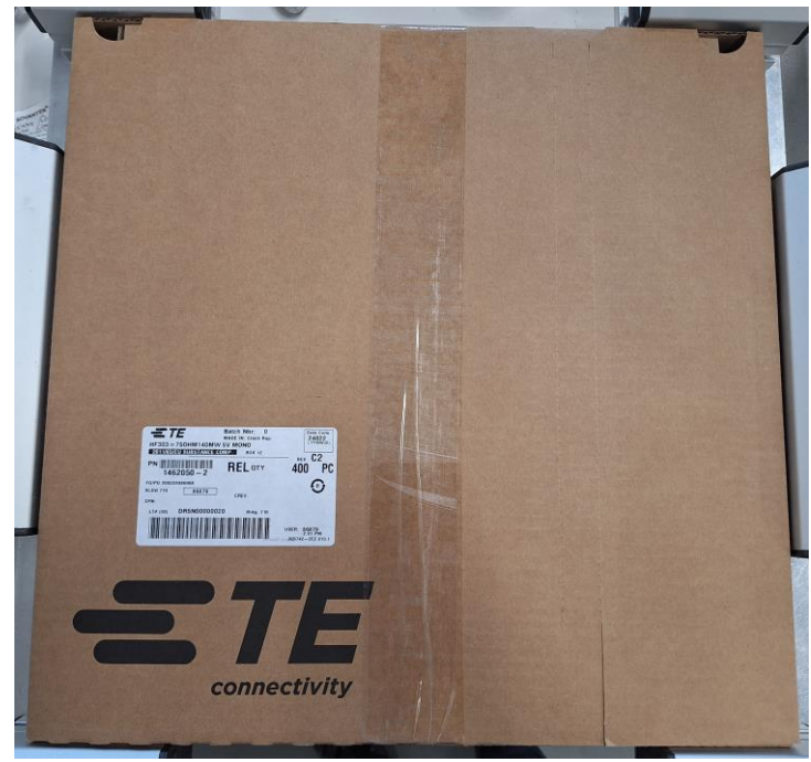
Figure 15: Inner box label position