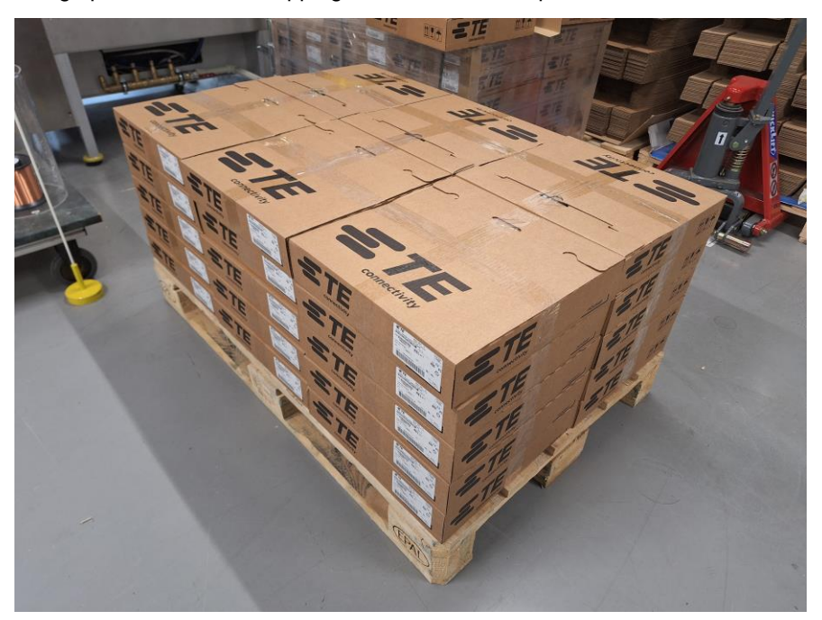
Figure 11: Palletizing of boxes