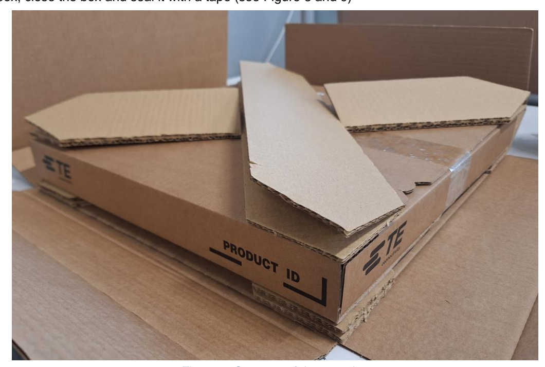
Figure 9: Contents of the outer box

I. Fold outer box PN 1-1462121-1, insert 4 shock absorbers PN 6-1462110-6 creating two "X" and the inner box, close the box and seal it with a tape (see Figure 8 and 9)