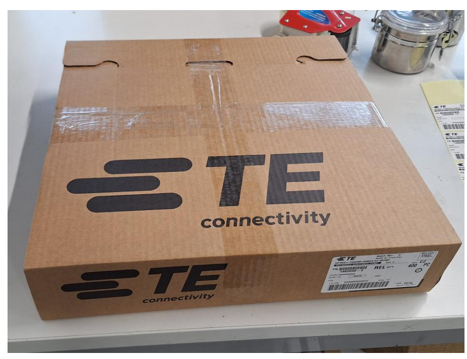
Figure 10: The sealed outer box

J. Place label PN 7-1904070-3 (see chapter 7.5. "Outer box label position") on the outer box.