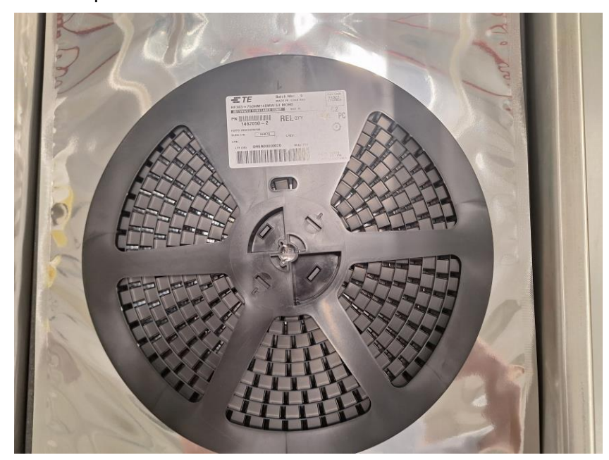
Figure 53: Blister tape reel label position