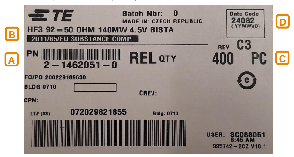
Figure 42: Licence tag (For ilustration only)

7.1. Label – reel, vacuum bag, inner box, outer box Label PN 7-1904070-3 (100x60mm) with print layout 995742-2CZ V10.1