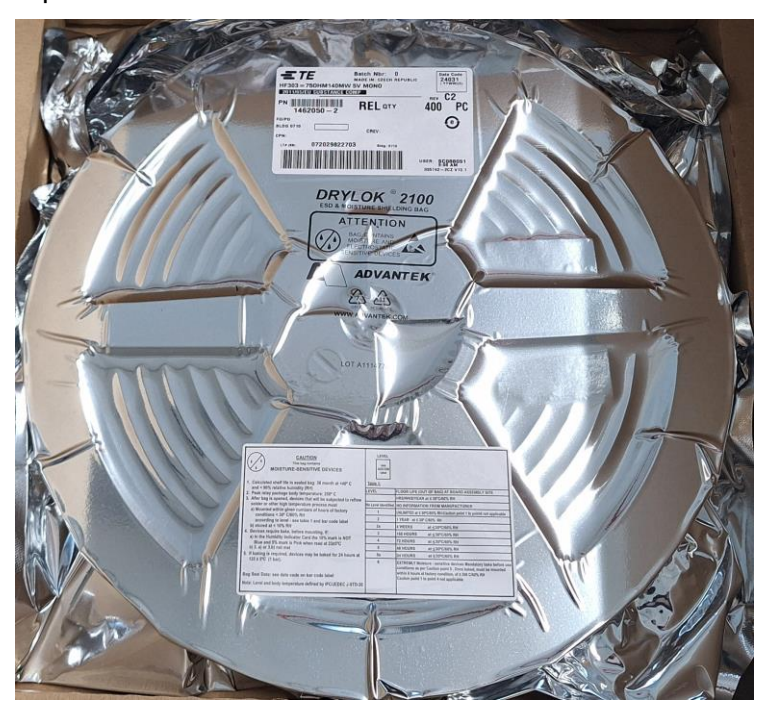
Figure 64: Vaccum bag label position