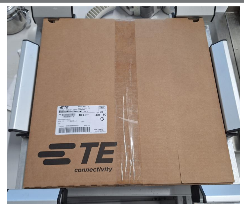
Figure 8: The sealed inner box

H. Place label PN 7-1904070-3 (see chapter 7.4. "Inner box label position") on the inner box.