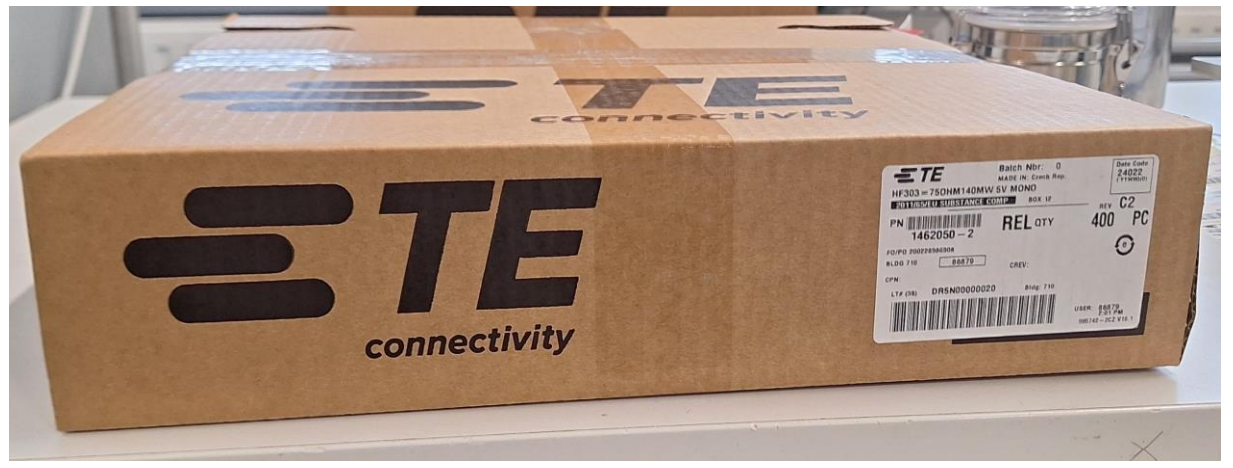
Figure 16: Outer box label position