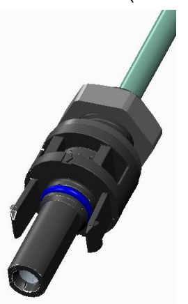
See Fig 2 Socket Connector Female PV4-P..... (PN 1971920)