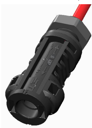
See Fig 1 Pin Connector Male PV4-P..... (PN 1971919)

The connector allows for 4.0mm<sup>2</sup> / AWG12, 6.0mm<sup>2</sup> / AWG10 cable (see Fig.1 and Fig.2)