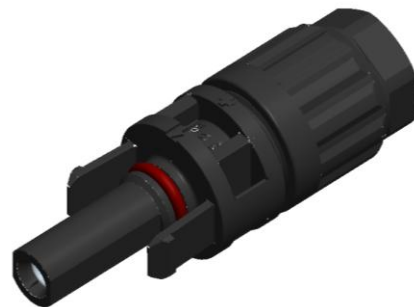
See Fig 2 Connector Female PV4-BX..... (PN 1971862)