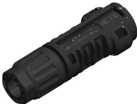
See Fig 1 Connector Male PV4-AX..... (PN 1971861)

The connector allows for 4.0mm 2 / AWG12, 6.0mm 2 / AWG10 cable (see Fig.1 and Fig.2)