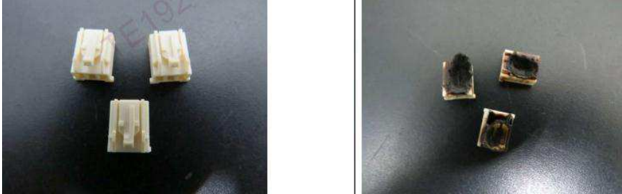
Test Set-2, PN 8-1971793-1, GI2.5 plug housing