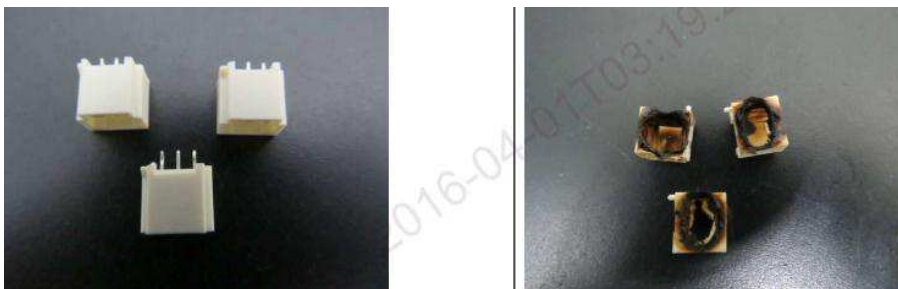
Test Set-4, PN 8-1971798-1, GI2.5 header assembly