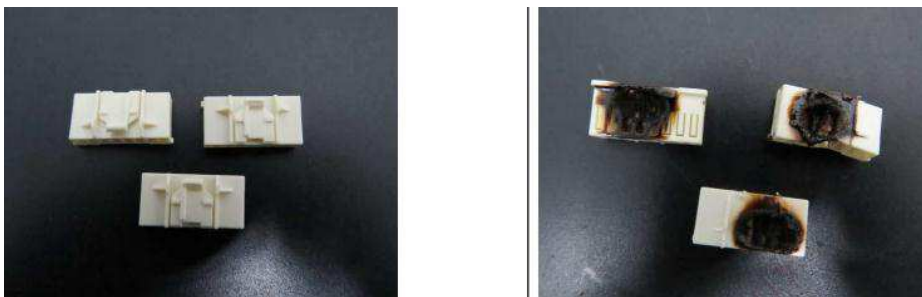
Test Set-3, PN 3-1971798-1, GI2.5 header assembly