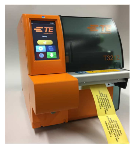
T3212 fitted with a perforator

For more details regarding printer accessories please consult TTDS-260, and for more details concerning the Universal reel holder please consult TTDS-259.