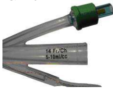
Inflation Valve & Drain