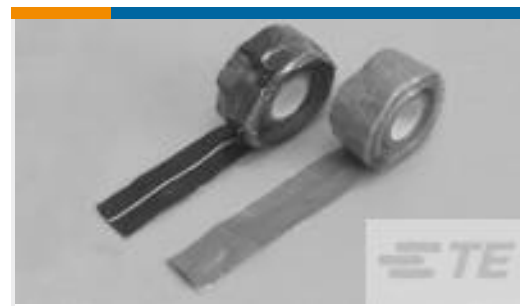
TE Part # 608036-9 SILICONE FUSION TAPE,1.5"X36'