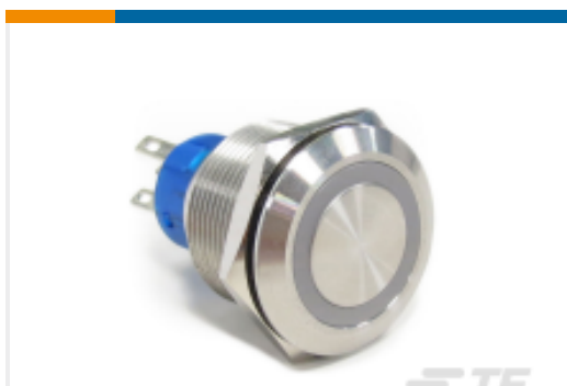
TE Part #6-2213772-5 AV22 DPL 5A MOVE RING LED RED 12V