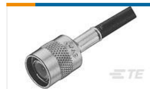
TE Part #5225555-8 TNC PLUG