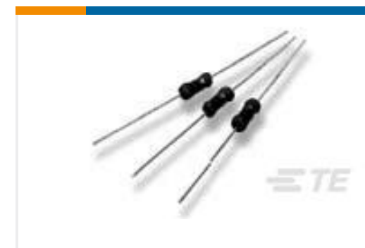
TE Part #4-1879355-8 RR03 5% 390K AMMO