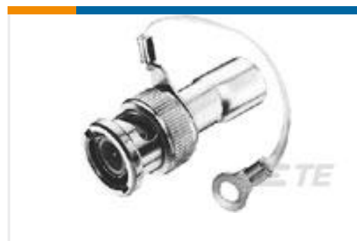
TE Part #221629-2 TERMINATOR,BNC,75 OHM,1 WATT