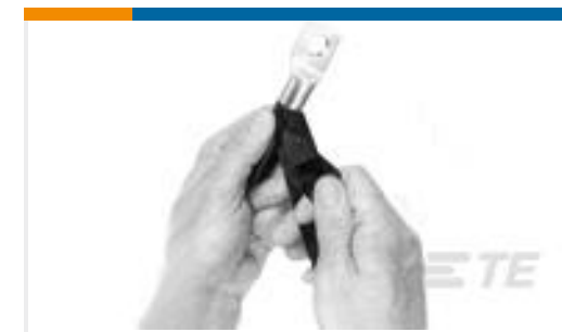
TE Part # 605262-1 FUSION TAPE, 1" X .020" X 10FT