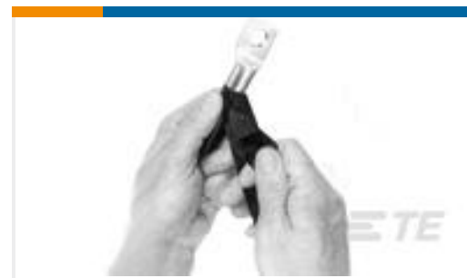
TE Part # 605980-1 FUSION TAPE, .75"X .020"X 30FT