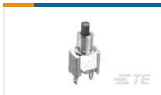
TE Part #2-1437572-6 TPC13F0=SW P/B MOMENTARY