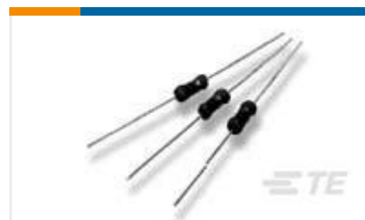
TE Part #1-1879354-2 RR03 5% R91 AMMO