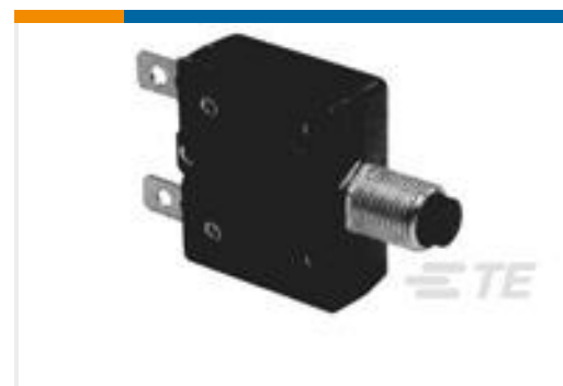
TE Part #1423674-5 W54-XB1A4A10-8=CKTBKR,THERM,PB