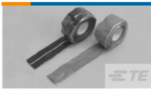
TE Part # 1-608036-2 SILICONE FUSION TAPE, 1"X36'