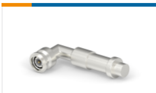
TE Part #5225554-9 TNC RT ANG PLUG DUAL