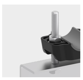
FLAT MOUNT VERSION

Used when installing on a mounting plate.